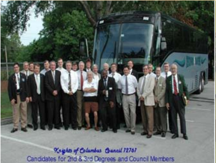
Knights of Columbus Council 12767 Candidates for 2nd & 3rd Degrees and Council Members